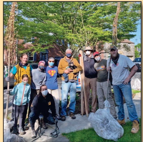
◆ Earth Day Celebrating Earth Day by planting trees on our street.