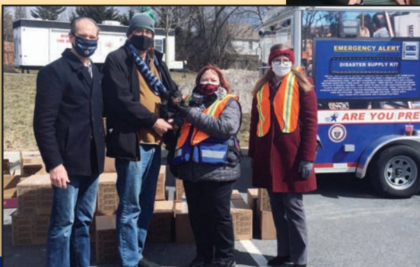
◆ Food Drive Collecting donations to help feed our neighbors in need.