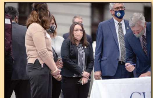
◆ Rally for Justice Attending a rally in Harrisburg to provide a pathway to justice for survivors of sexual abuse.