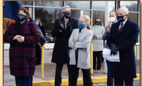
◆ Delaware County Wellness Center Celebrating the opening of the Delaware County Wellness Center in Yeadon, which will become home to the county's health department.