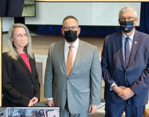
◆ Secretary Cardona Welcoming U.S. Education Secretary Miguel Cardona to Beverly Hills Middle School in Upper Darby.