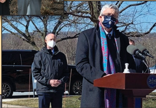
◆ Small Business Support Announcing a new grant program for the hospitality industry with Gov. Tom Wolf.