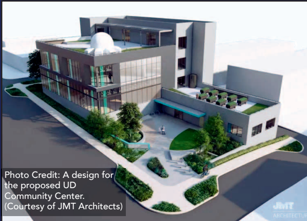
Photo Credit: A design for the proposed UD Community Center. (Courtesy of JMT Architects)

Delaware County is not alone in this fight – rural Pennsylvania is similarly facing a crisis of disappearing hospital and nursing home services in the face of greater consolidation in these industries. A bipartisan approach is vital to prioritize patients over profit and protect all Pennsylvania communities from further harm.